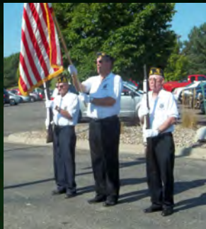
Farmington American Legion Color Guard