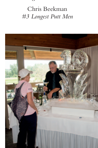
10th Anniversary Ice Sculpture with Martini Luge.