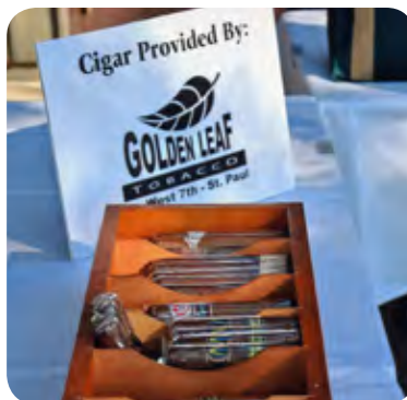
Golden Leaf Tobaccos provided some fine cigars for the tournament.