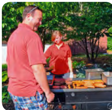
Enjoying the delicious food provided by Print Solutions and New Horizons Foods.