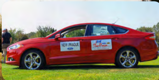
New Prague Ford came through again this year as our Hole in One Car Sponsor with two beautiful Ford Taurus cars.