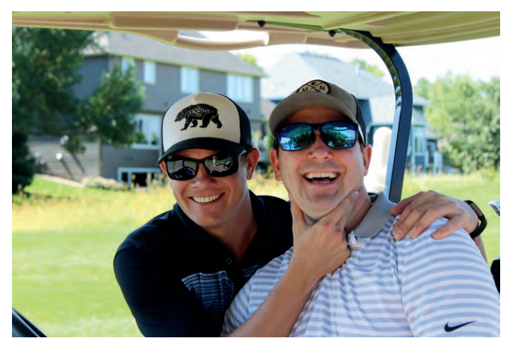
He choked on the putt!